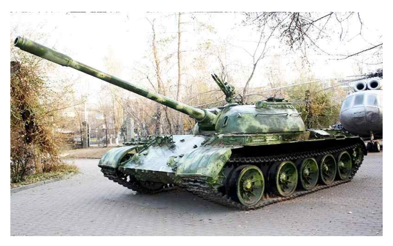
Figure 1. Military equipment in Family Park

Perhaps, the second oldest park in Almaty is Family park, which was first opened in 1990 as the 50th Anniversary of October Park. Park also has an amusement park, aqua park, bowling, carting, little zoo park and many other things to enjoy. One of the unusual points of the park is that it has an outdoor exhibition of military machines as Boramae Park in Seoul has airplane sculptures(Figure 1).