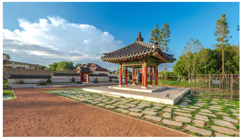
Figure 2. Kazakhstan-Korea friendship park

In 2017 Astana also held EXPO and the facilities built for it are now used as theme park. The outside territory is mostly used as a children's park and the main pavilion is called 'Nur Alem' museum. The first and eighth floors of the museum tell the story of Kazakhstan and the future of Astana, while the eighth floor has an observation platform. Another unique theme park in Astana is 'Kazakhstan-Korea friendship park' (Figure 2), which was opened in 2017.