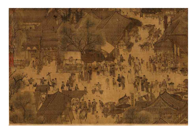
Figure 1. A part of Riverside scene at Qingming Festival

Song Cheng, as the first theme park in China to fully display the Culture of the Song Dynasty, takes "architecture as the shape, culture as the soul"as the business philosophy, and imitated the style of the Song Dynasty. The buildings in the theme park is built according to the long scroll 《Riverside scene at Qingming Festival》, which restored the market culture and folk customs of the Song Dynasty. By creating a cultural landscape space with strong participation, tourists can place themselves in a rich atmosphere full of Song Dynasty culture, and fully mobilize their senses to fell Song Dynasty culture and understand the true meaning of Song Dynasty culture.